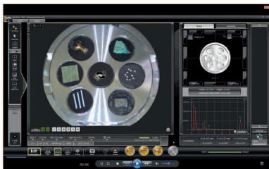
Intuitive graphic user interface